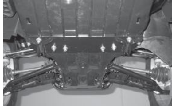
FIGURE 6 / Front of Bike